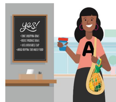
Avoid excess packaging.