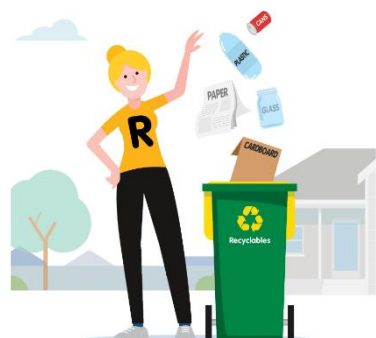
Recycle only these five things.