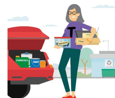
Take special waste to drop-off points.