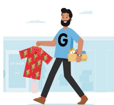
Gift to charity, swap or sell.