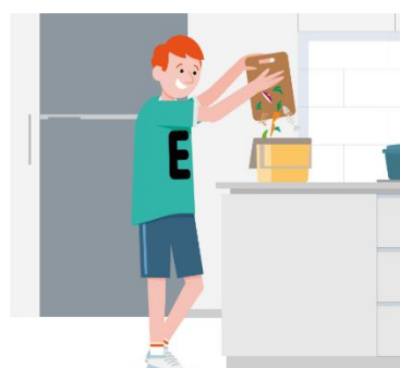
Earth-Cycle food scraps and garden waste into compost.